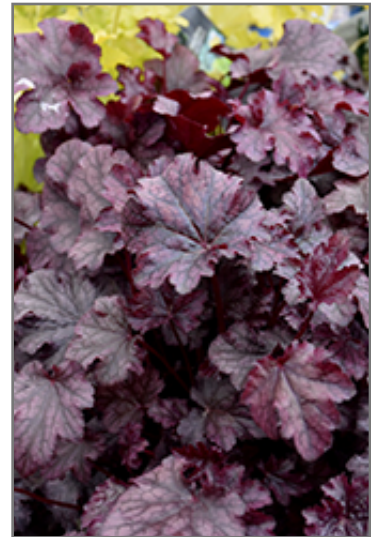
Plum Pudding Coral Bells foliage

Plum Pudding Coral Bells is recommended for the following landscape applications;