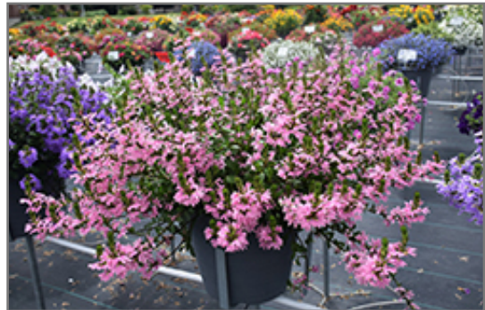
Whirlwind Pink Fan Flower in bloom

Whirlwind Pink Fan Flower is a fine choice for the garden, but it is also a good selection for planting in outdoor containers and hanging baskets. Because of its trailing habit of growth, it is ideally suited for use as a 'spiller' in the 'spiller-thriller-filler' container combination; plant it near the edges where it can spill gracefully over the pot. Note that when growing plants in outdoor containers and baskets, they may require more frequent waterings than they would in the yard or garden.