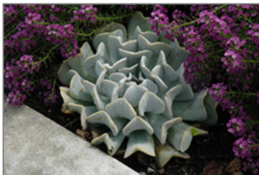
Topsy Turvy Echeveria