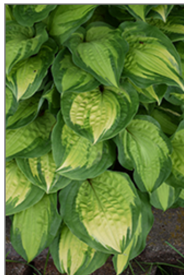
Island Breeze Hosta foliage