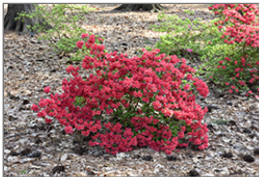
Girard's Crimson Azalea in bloom