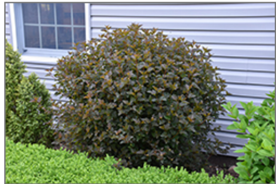
Ginger Wine Ninebark