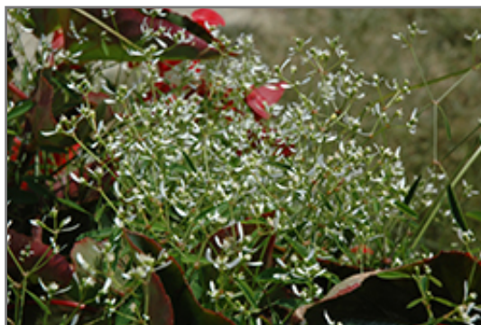
Glitz Euphorbia flowers

Glitz Euphorbia is a fine choice for the garden, but it is also a good selection for planting in outdoor containers and hanging baskets. It is often used as a 'filler' in the 'spiller-thriller-filler' container combination, providing a mass of flowers against which the thriller plants stand out. Note that when growing plants in outdoor containers and baskets, they may require more frequent waterings than they would in the yard or garden.