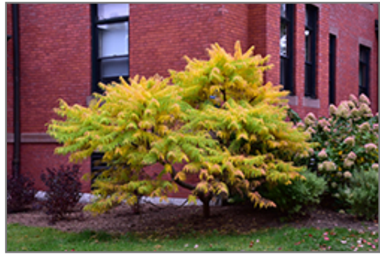
Tiger Eyes Sumac in fall