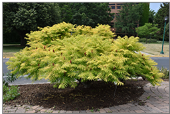
Tiger Eyes Sumac