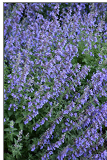
Cat's Meow Catmint flowers

Cat's Meow Catmint is recommended for the following landscape applications;