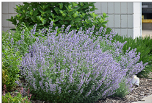
Cat's Meow Catmint in bloom