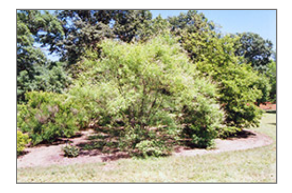
Chaste Tree