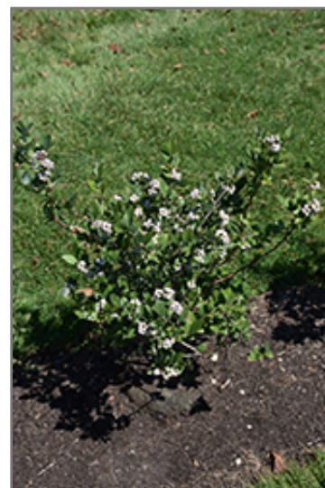
Elliott Blueberry fruit