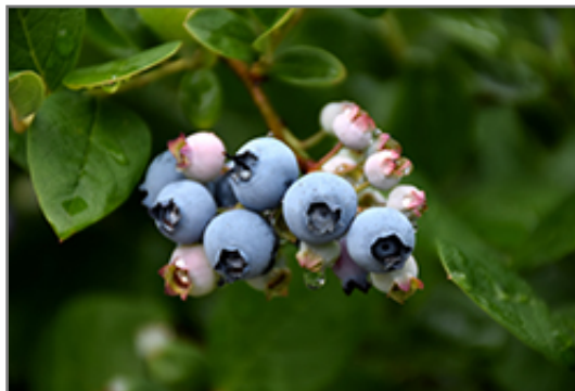
Elliott Blueberry fruit

Elliott Blueberry features dainty clusters of white bell-shaped flowers with shell pink overtones hanging below the branches in mid spring. It has green deciduous foliage. The glossy oval leaves turn yellow in fall. It features an abundance of magnificent blue berries from late summer to early fall. The smooth brick red bark adds an interesting dimension to the landscape.