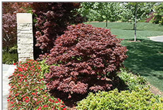
Rhode Island Red Japanese Maple