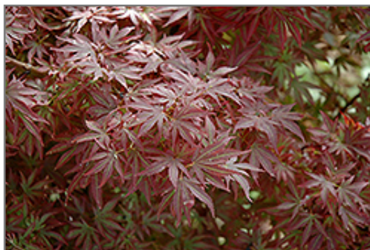
Aratama Japanese Maple foliage