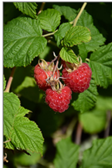
Raspberry Shortcake Raspberry fruit

Raspberry Shortcake Raspberry has rich green deciduous foliage on a plant with an upright spreading habit of growth. The textured oval compound leaves do not develop any appreciable fall color. It features an abundance of magnificent red berries in mid summer.