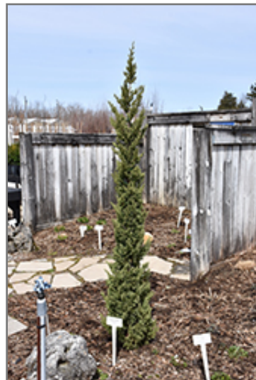
Trautman Juniper

This shrub should only be grown in full sunlight. It is very adaptable to both dry and moist growing conditions, but will not tolerate any standing water. It is not particular as to soil type or pH. It is highly tolerant of urban pollution and will even thrive in inner city environments. This is a selected variety of a species not originally from North America.