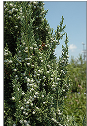
Trautman Juniper fruit