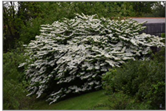
Maries Doublefile Viburnum in bloom

Maries Doublefile Viburnum is recommended for the following landscape applications;