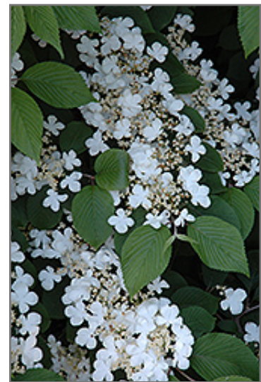
Maries Doublefile Viburnum flowers