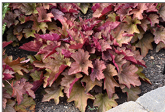
Carnival Watermelon Coral Bells