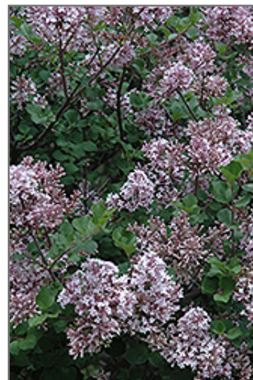
Dwarf Korean Lilac flowers

Dwarf Korean Lilac is recommended for the following landscape applications;