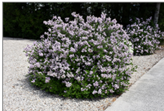
Dwarf Korean Lilac in bloom