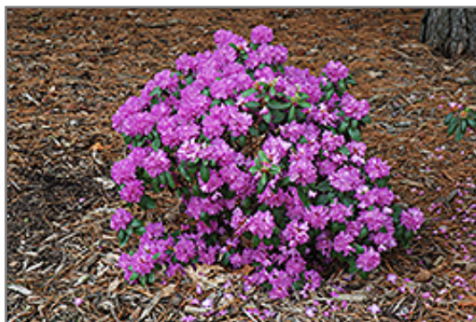
Compact P.J.M. Rhododendron in bloom