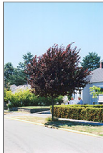
Newport Plum