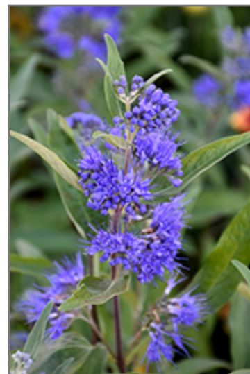
Sapphire Surf Caryopteris flowers

Sapphire Surf Caryopteris is recommended for the following landscape applications;