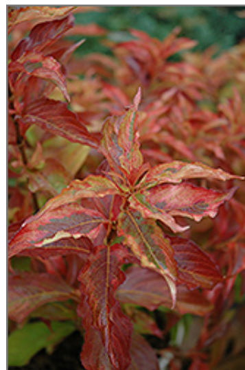
My Monet Sunset Weigela foliage

My Monet Sunset Weigela makes a fine choice for the outdoor landscape, but it is also well-suited for use in outdoor pots and containers. It is often used as a 'filler' in the 'spiller-thriller-filler' container combination, providing a mass of flowers and foliage against which the thriller plants stand out. Note that when grown in a container, it may not perform exactly as indicated on the tag - this is to be expected. Also note that when growing plants in outdoor containers and baskets, they may require more frequent waterings than they would in the yard or garden.