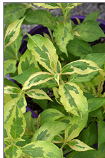
My Monet Sunset Weigela foliage

My Monet Sunset Weigela is recommended for the following landscape applications;