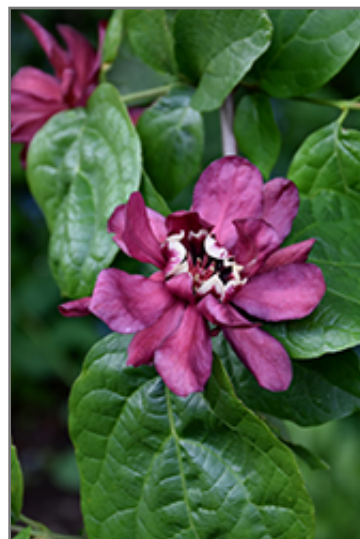
Hartlage Wine Sweetshrub flowers